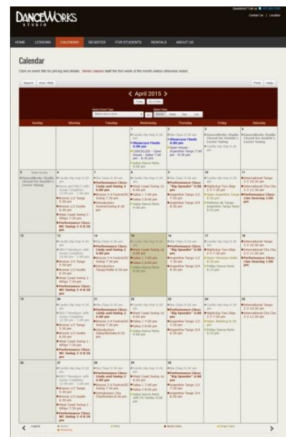
Desk or Wall Type On-line Calendar

The advantage of the desk type calendar is that one can easily see at a glance what is happening each day as well as the entire month. And more importantly, has the ability to print out each month which could then be posted on one’s wall or refrigerator or inserted in one’s newspaper or in other publications.