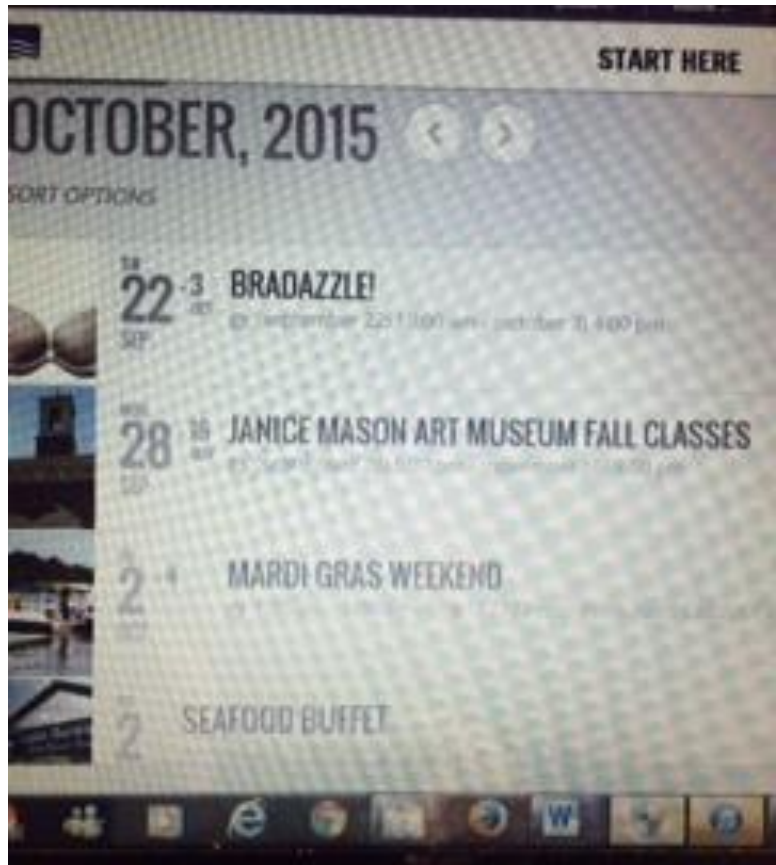
Current tourism e-calendar is not very printer-friendly

If one clicks on any of the dates, a window pops open and provides additional information such as details about the event, directions to the location, time, dates and more. The challenge comes when one tries to print the information which requires multiple sheets of paper and difficult to review at a glance.